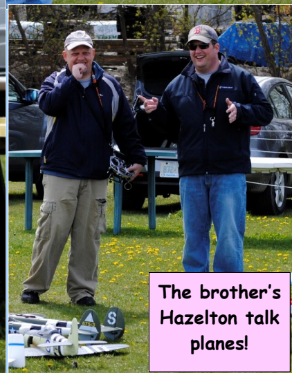
The brother's Hazelton talk planes!