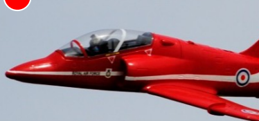
Ken's ESC went up with a scale like smoke trail!